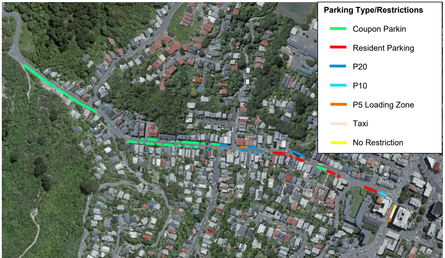
Figure 3-1. Current Parking on Willis Street and Aro Street