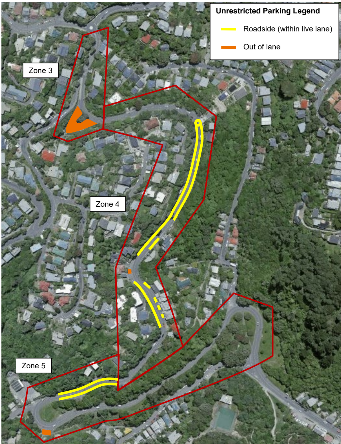
Figure 3-3. Current Parking on Raroa – Plunket Street to Holloway Road